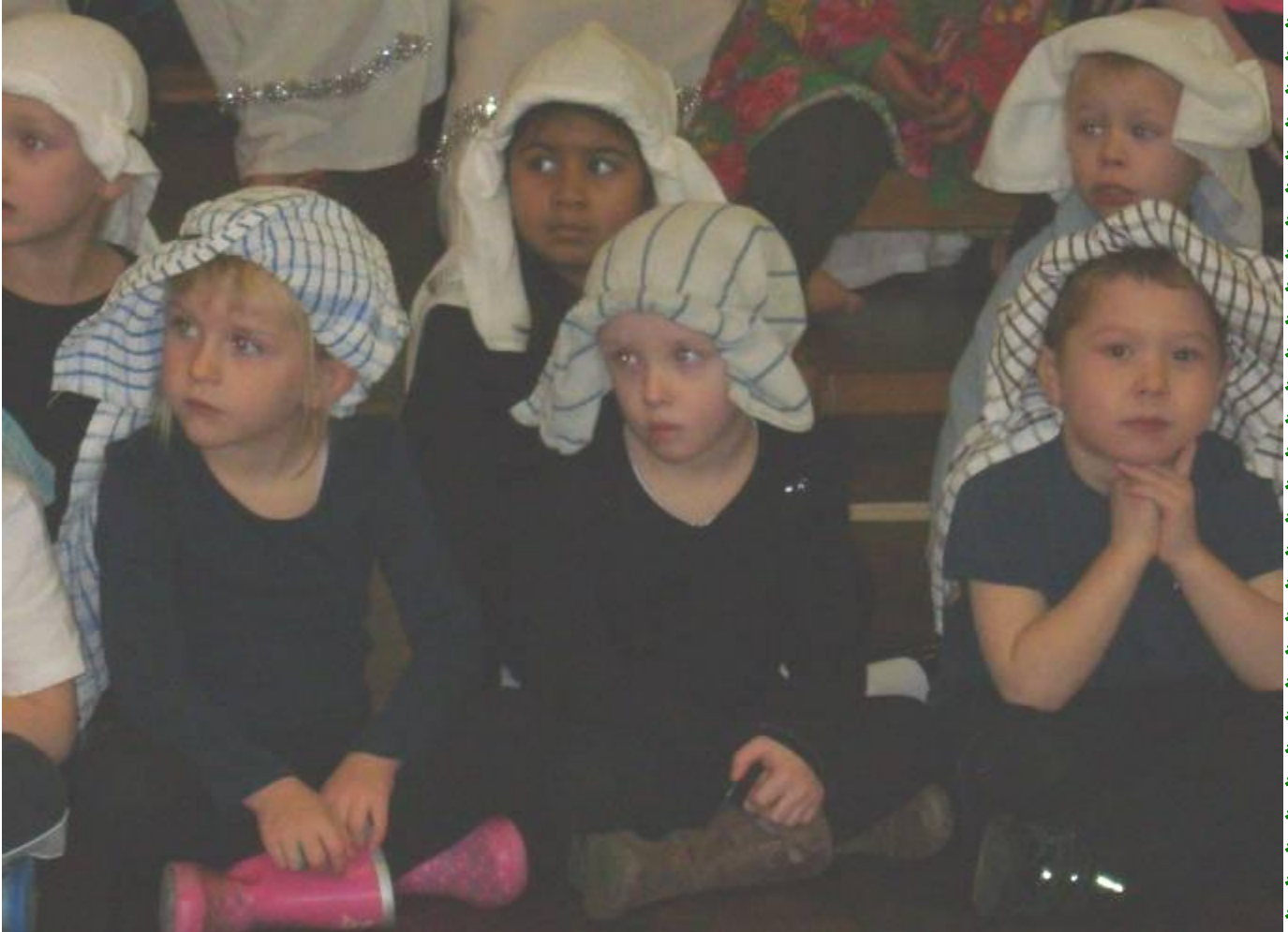
Shepherds Abiding in the Upper School Hall

Q: How many chimneys does Father Christmas go down?