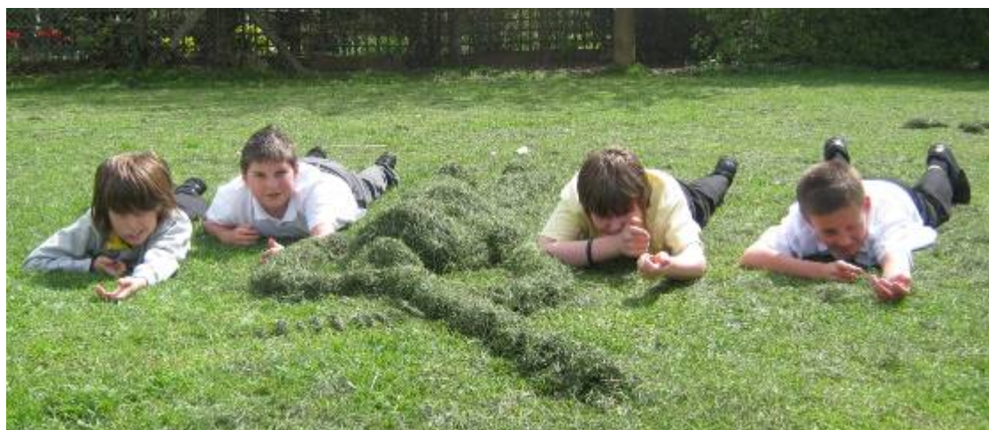
Pupil: Daddy cat, mummy cat and two kittens!

box in the reception area outside the school office.