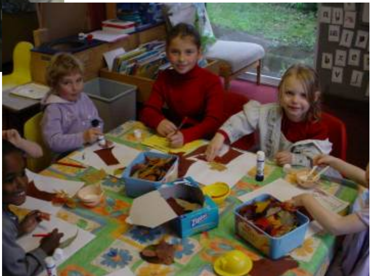
Some of our 'afternoon teachers'