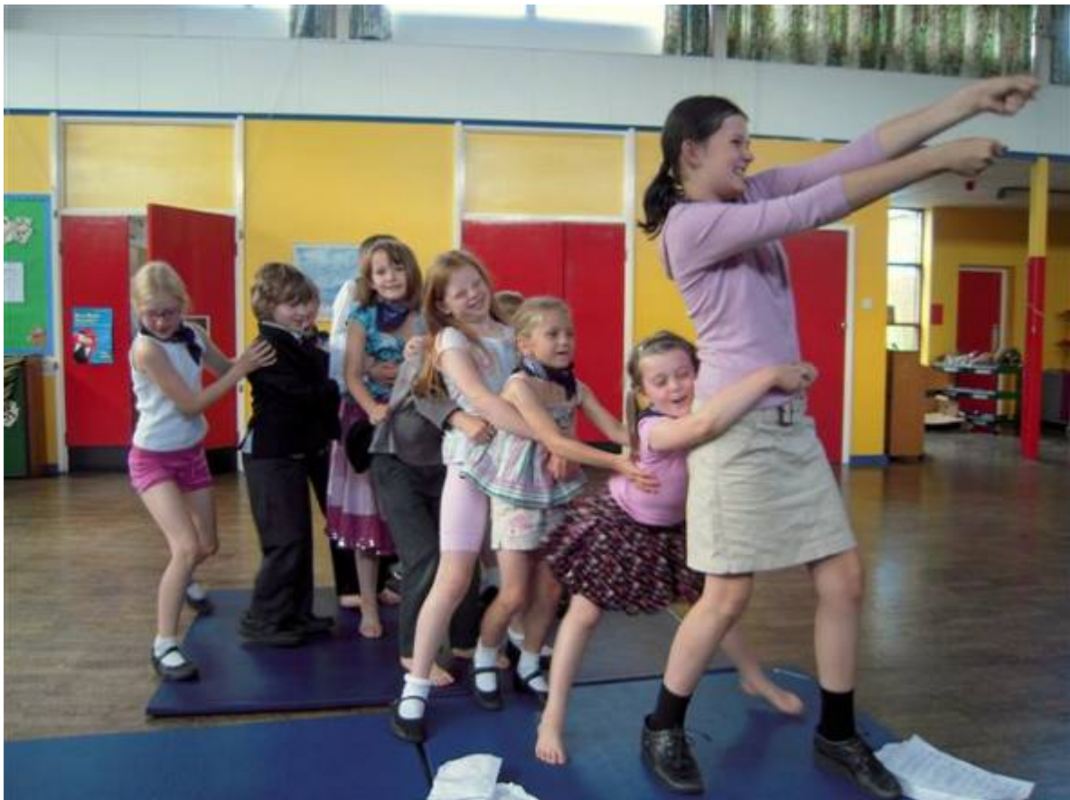
Little Tanks - After School Drama Club