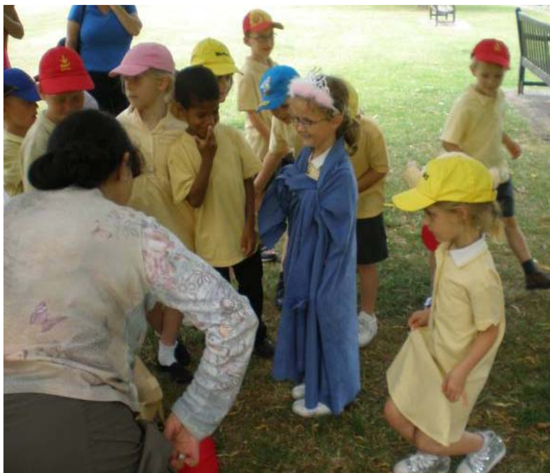
Curtseying to Queen Isis – Year 1 at the Henley River and Rowing Museum

How do you know that carrots are good for your eyes?