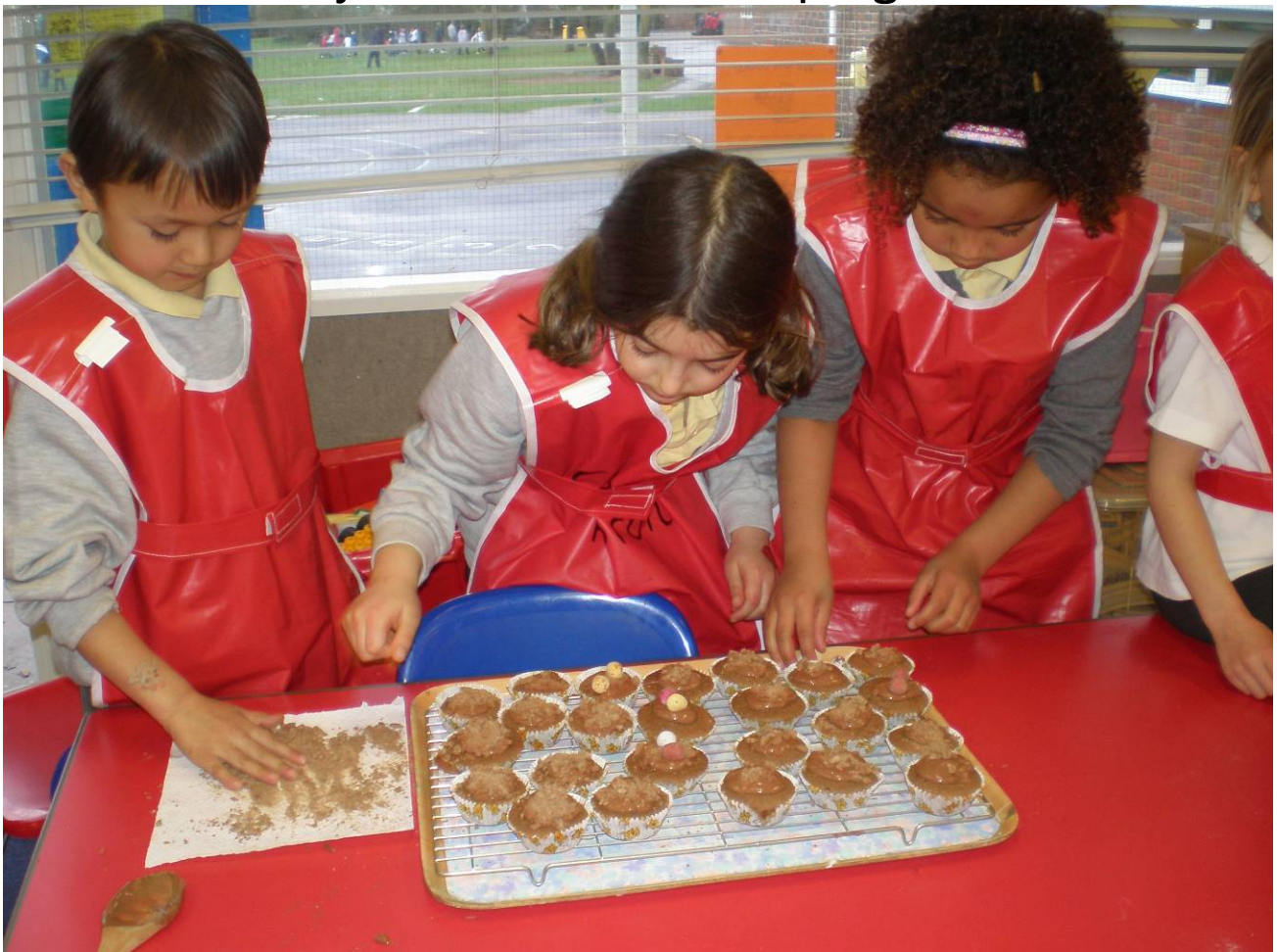
Y2 Cookery Club – Making Easter Cakes